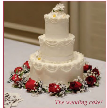
The wedding cake!