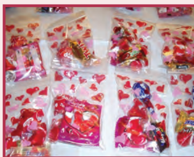
Friendly Home Members put together some sweet Valentine treats for the students.