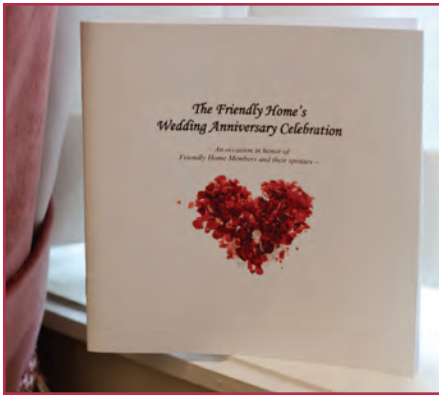
Wedding stories and photos shared by the anniversary couples were captured in a booklet created especially for the celebration.