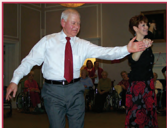
Professional ballroom dancers joined us at the Sweetheart Ball, demonstrating dances such as the cha-cha, waltz, and fox trot.